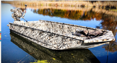
SWAMP DRAGON MODIFIED-Vs & DUCK BOATS