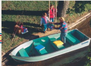
DuraNautic UTILITY & V-HULLS

Marathon helps drive consumers to retailers with marketing support using our dealer locator, media support, and more.