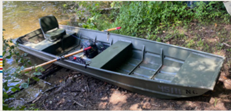
The Duke JON BOATS