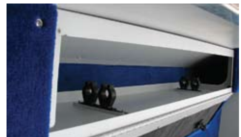
Oneida rod locker