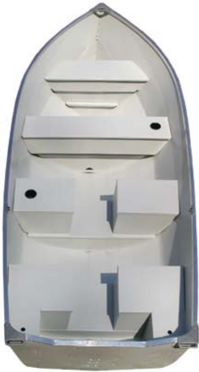
Seneca 14' or 16' Double Split