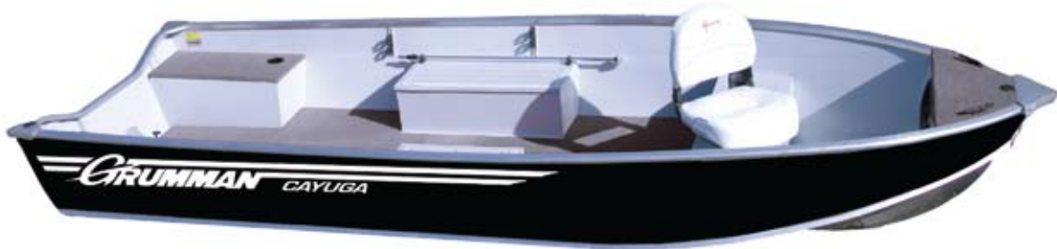
Shown with optional fold-down chair

The Cayuga Series combines the rugged dependability of our 14 and 16 foot Seneca V hulls with the convenience of built in livewells / baitwells and the wide-open roominess of the flat floored classic split-seat design. Floors are covered in your choice of silver-gray textured vinyl flooring or plush royal blue or marble gray marine carpeting. The Cayuga 14 is the perfect choice for flat floored fishing fun on a budget. Or choose the upscale Cayuga 16 for standard features which include switch-paneled livewell aeration pump, bilge pump, and navigation lights. Either way, you'll love the freedom of movement afforded by the Grumman Cayuga Series!