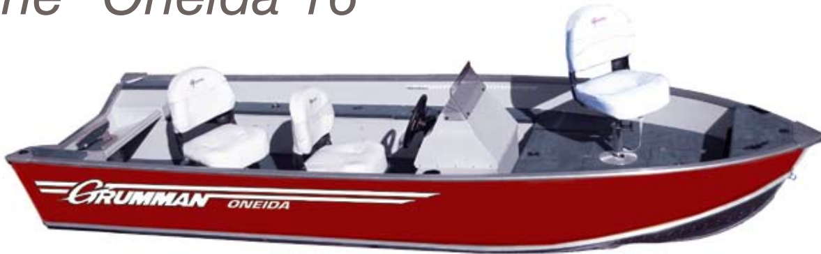
Shown with optional third pedestal and seat

The "Oneida" is the perfect choice when you're ready to do without compromise. It's our ultimate offering for serious fishing or just plain cruising fun. Quiet as a summer breeze, our deep, five-keel hull design makes for a more stable, smooth, chop-flattening ride. And luxury comes standard with plenty of comfortable seating and your choice of plush or textured floor coverings. Fishermen will appreciate the lockable rod storage, 12 volt trolling motor receptacle, bow casting platform and aerated livewell. A tough boat, designed and built from the keels up to give you years of great performance, the Oneida 16 is all Grumman and represents the top of our model line.