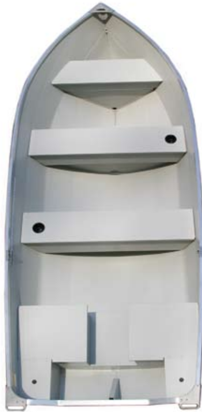
Seneca 14' or 16' Split Cutout